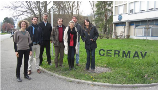
Algaecom Team at Cermav premise.