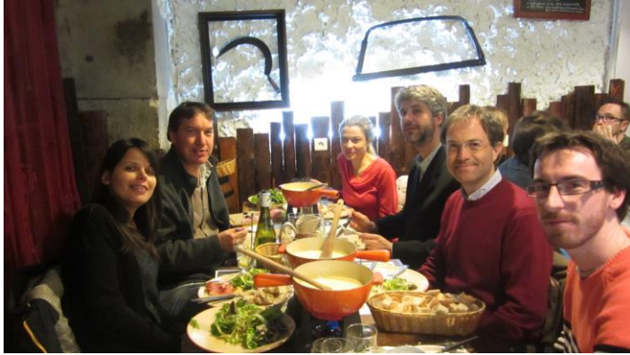
Algaecom Team is tasting fondue au fromage at Fondue .